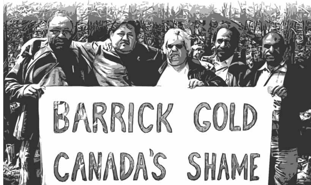
PHOTO: INDIGENOUS LEADERS FROM CHILE, AUSTRALIA AND PAPUA NEW GUINEA UNITE IN CANADA TO SPEAK THEIR TRUTH AT BARRICK'S ANNUAL GENERAL MEETING IN 2008.

Contact: MunkOUTofUofT@gmail.com if you have any questions or want to get involved!